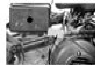
Location of Engine Serial Number