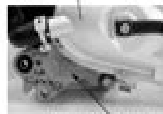
Location of Engine Serial Number