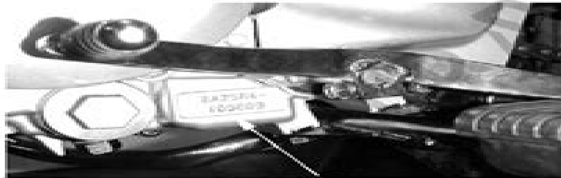
Location of Engine Serial Number