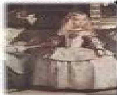
Las Meninas by Diego Velázquez 1656