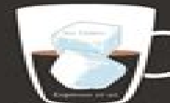
CAFÉ CON HIELO