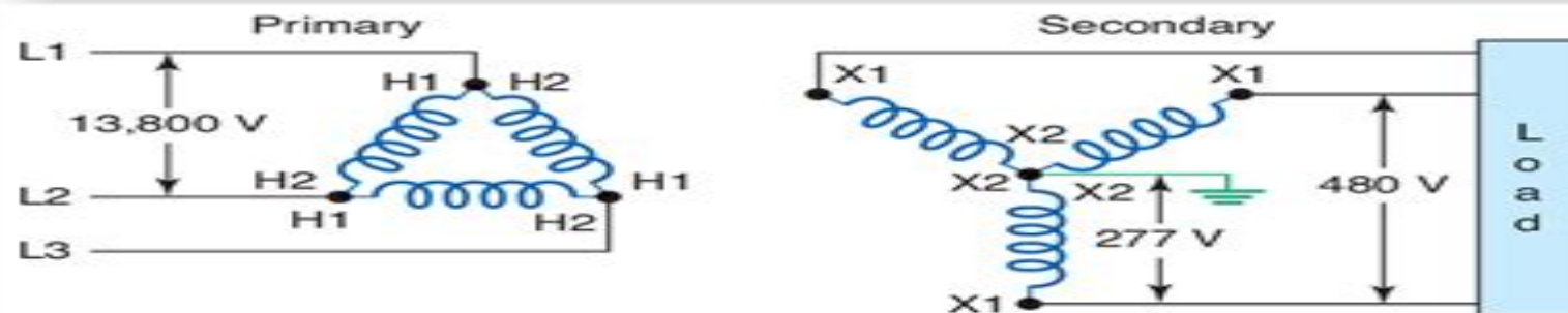
Delta-wye three-phase transformer connection