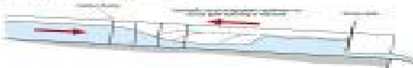
Figure 1 shows the setup for the experiment. The water is pumped into the Venturi tube from a reservoir. The pressure is measured at the inlet, the constriction, and the outlet. The flow rate is then calculated using the Bernoulli equation. The Bernoulli equation states that the sum of the pressure, the kinetic energy per unit volume, and the potential energy per unit volume is constant. This equation can be used to calculate the flow rate of the fluid in the pipe.