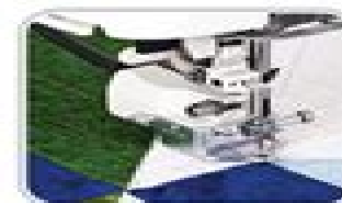
A.S.R. (Accurate Stitch Regulator)