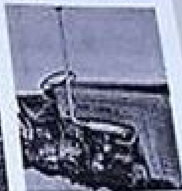
1999, 2000, 2001, 2002, 2003, 2004, 2005, 2006, 2007, 2008, 2009, 2010, 2011, 2012, 2013, 2014, 2015, 2016, 2017, 2018, 2019, 2020, 2021, 2022, 2023, 2024, 2025, 2026, 2027, 2028, 2029, 2030, 2031, 2032, 2033, 2034, 2035, 2036, 2037, 2038, 2039, 2040, 2041, 2042, 2043, 2044, 2045, 2046, 2047, 2048, 2049, 2050, 2051, 2052, 2053, 2054, 2055, 2056, 2057, 2058, 2059, 2060, 2061, 2062, 2063, 2064, 2065, 2066, 2067, 2068, 2069, 2070, 2071, 2072, 2073, 2074, 2075, 2076, 2077, 2078, 2079, 2080, 2081, 2082, 2083, 2084, 2085, 2086, 2087, 2088, 2089, 2090, 2091, 2092, 2093, 2094, 2095, 2096, 2097, 2098, 2099, 2100, 2101, 2102, 2103, 2104, 2105, 2106, 2107, 2108, 2109, 2110, 2111, 2112, 2113, 2114, 2115, 2116, 2117, 2118, 2119, 2120, 2121, 2122, 2123, 2124, 2125, 2126, 2127, 2128, 2129, 2130, 2131, 2132, 2133, 2134, 2135, 2136, 2137, 2138, 2139, 2140, 2141, 2142, 2143, 2144, 2145, 2146, 2147, 2148, 2149, 2150, 2151, 2152, 2153, 2154, 2155, 2156, 2157, 2158, 2159, 2160, 2161, 2162, 2163, 2164, 2165, 2166, 2167, 2168, 2169, 2170, 2171, 2172, 2173, 2174, 2175, 2176, 2177, 2178, 2179, 2180, 2181, 2182, 2183, 2184, 2185, 2186, 2187, 2188, 2189, 2190, 2191, 2192, 2193, 2194, 2195, 2196, 2197, 2198, 2199, 2200, 2201, 2202, 2203, 2204, 2205, 2206, 2207, 2208, 2209, 2210, 2211, 2212, 2213, 2214, 2215, 2216, 2217, 2218, 2219, 2220, 2221, 2222, 2223, 2224, 2225, 2226, 2227, 2228, 2229, 2230, 2231, 2232, 2233, 2234, 2235, 2236, 2237, 2238, 2239, 2240, 2241, 2242, 2243, 2244, 2245, 2246, 2247, 2248, 2249, 2250, 2251, 2252, 2253, 2254, 2255, 2256, 2257, 2258, 2259, 2260, 2261, 2262, 2263, 2264, 2265, 2266, 2267, 2268, 2269, 2270, 2271, 2272, 2273, 2274, 2275, 2276, 2277, 2278, 2279, 2280, 2281, 2282, 2283, 2284, 2285, 2286, 2287, 2288, 2289, 2290, 2291, 2292, 2293, 2294, 2295, 2296, 2297, 2298, 2299, 2300, 2301, 2302, 2303, 2304, 2305, 2306, 2307, 2308, 2309, 2310, 2311, 2312, 2313, 2314, 2315, 2316, 2317, 2318, 2319, 2320, 2321, 2322, 2323, 2324, 2325, 2326, 2327, 2328, 2329, 2330, 2331, 2332, 2333, 2334, 2335, 2336, 2337, 2338, 2339, 2340, 2341, 2342, 2343, 2344, 2345, 2346, 2347, 2348, 2349, 2350, 2351, 2352, 2353, 2354, 2355, 2356, 2357, 2358, 2359, 2360, 2361, 2362, 2363, 2364, 2365, 2366, 2367, 2368, 2369, 2370, 2371, 2372, 2373, 2374, 2375, 2376, 2377, 2378, 2379, 2380, 2381, 2382, 2383, 2384, 2385, 2386, 2387, 2388, 2389, 2390, 2391, 2392, 2393, 2394, 2395, 2396, 2397, 2398, 2399, 2400, 2401, 2402, 2403, 2404, 2405, 2406, 2407, 2408, 2409, 2410, 2411, 2412, 2413, 2414, 2415, 2416, 2417, 2418, 2419, 2420, 2421, 2422, 2423, 2424, 2425, 2426, 2427, 2428, 2429, 2430, 2431, 2432, 2433, 2434, 2435, 2436, 2437, 2438, 2439, 2440, 2441, 2442, 2443, 2444, 2445, 2446, 2447, 2448, 2449, 2450, 2451, 2452, 2453, 2454, 2455, 2456, 2457, 2458, 2459, 2460, 2461, 2462, 2463, 2464, 2465, 2466, 2467, 2468, 2469, 2470, 2471, 2472, 2473, 2474, 2475, 2476, 2477, 2478, 2479, 2480, 2481, 2482, 2483, 2484, 2485, 2486, 2487, 2488, 2489, 2490, 2491, 2492, 2493, 2494, 2495, 2496, 2497, 2498, 2499, 2500, 2501, 2502, 2503, 2504, 2505, 2506, 2507, 2508, 2509, 2510, 2511, 2512, 2513, 2514, 2515, 2516, 2517, 2518, 2519, 2520, 2521, 2522, 2523, 2524, 2525, 2526, 2527, 2528, 2529, 2530, 2531, 2532, 2533, 2534, 2535, 2536, 2537, 2538, 2539, 2540, 2541, 2542, 2543, 2544, 2545, 2546, 2547, 2548, 2549, 2550, 2551, 2552, 2553, 2554, 2555, 2556, 2557, 2558, 2559, 2560, 2561, 2562, 2563, 2564, 2565, 2566, 2567, 2568, 2569, 2570, 2571, 2572, 2573, 2574, 2575, 2576, 2577, 2578, 2579, 2580, 2581, 2582, 2583, 2584, 2585, 2586, 2587, 2588, 2589, 2590, 2591, 2592, 2593, 2594, 2595, 2596, 2597, 2598, 2599, 2600, 2601, 2602, 2603, 2604, 2605, 2606, 2607, 2608, 2609, 2610, 2611, 2612, 2613, 2614, 2615, 2616, 2617, 2618, 2619, 2620, 2621, 2622, 2623, 2624, 2625, 2626, 2627, 2628, 2629, 2630, 2631, 2632, 2633, 2634, 2635, 2636, 2637, 2638, 2639, 2640, 2641, 2642, 2643, 2644, 2645, 2646, 2647, 2648, 2649, 2650, 2651, 2652, 2653, 2654, 2655, 2656, 2657, 2658, 2659, 2660, 2661, 2662, 2663, 2664, 2665, 2666, 2667, 2668, 2669, 2670, 2671, 2672, 2673, 2674, 2675, 2676, 2677, 2678, 2679, 2680, 26