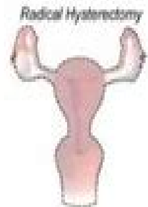
Types of Hysterectomy