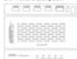
HDMI™ Splitter 1x4 Support All@HD™