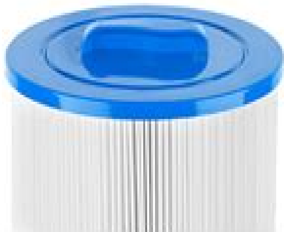
Top End Cap