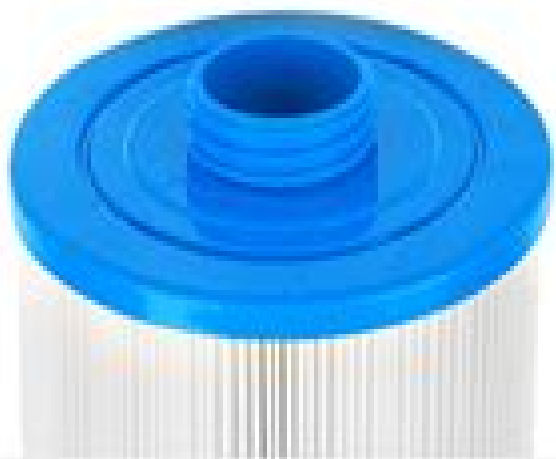
Bottom End Cap