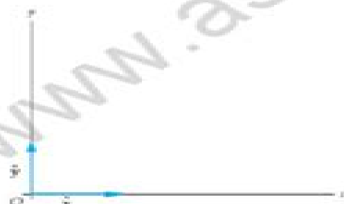
FIGURE 3-15 Unit vectors. The unit vectors \hat{x} and \hat{y} point in the positive x and y directions, respectively.