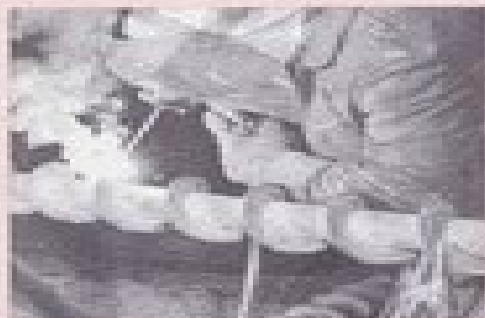
MAINTENANCE. Versatile for welding all types of work . . . carbon, alloy and stainless as well as non-ferrous metals.