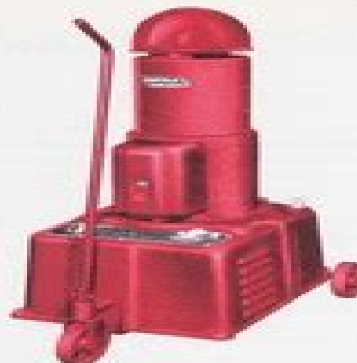
Lincwelder DC-250-MB portable unit with R-FET undercontrol

With this Lincwelder you are sure of the right arc for every job. The right type of arc combined with the correct arc intensity is instantly set on the Dual Continuous Controls. Each control is self-indicating and continuous in operation . . . gives positive, split second operation and eliminates the need for fragile meters.