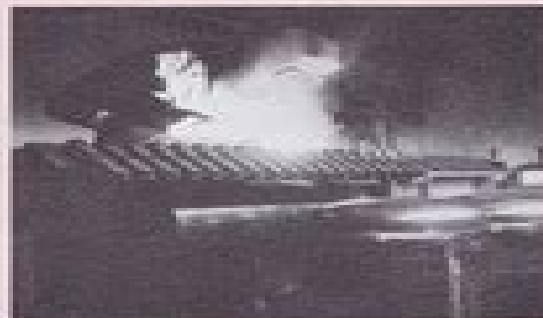
LIGHT GAUGE WORK. Thin gauge material is welded easily, without burn-through, as in the fabrication of these components.