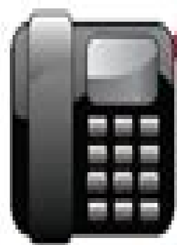
Analog Phone, Fax, or Paging System