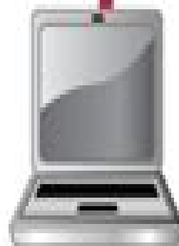
Computer or Laptop