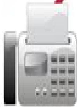
Fax Machine (2nd-Port Fax Plan Only)