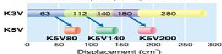
•Variation of pump displacement

With new technology the K5V series has enabled increased power density.