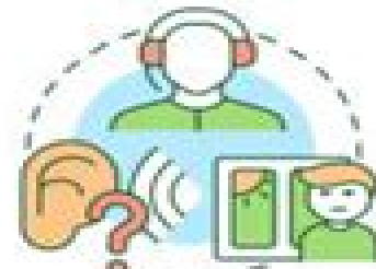
Appears Not To Be Listening