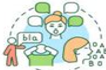
Talking Too Much