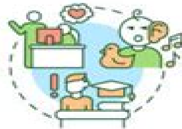
Be Easily Distracted