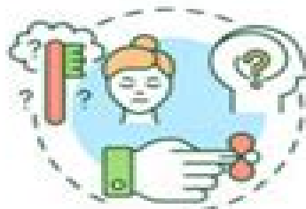
Forgets Daily Activities