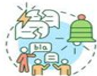
Interrupting Others Conversations