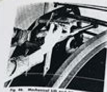
Fig. 46. Mechanical Lift and Lift Rod View

is the lower bracket, which is attached to the lower spread frame by three \frac{1}{4} x 2 1/2 inch bolts provided.