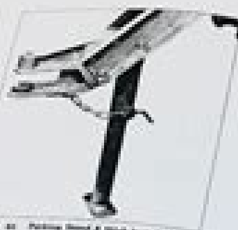
Fig. 43. Parking Stand & Shock Assembly

8. Attach the two shock brackets to forward main frame, use lift rod frame suggested in