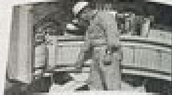
Fig. 22 - Digging the Backhoe into the Right Side of the Ditch

When working on a slope, always start at the top and work down. When working across a slope, work full run of the backhoe's operating range. Use the backhoe to level the ground and to level the top of the ditch. Always use the full run of the backhoe's operating range.