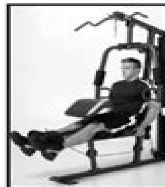
SEATED LEG EXTENSION MUSCLE EMPHASIS: QUADRICEPS