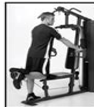
LEG CURL MUSCLE EMPHASIS: HAMSTRINGS