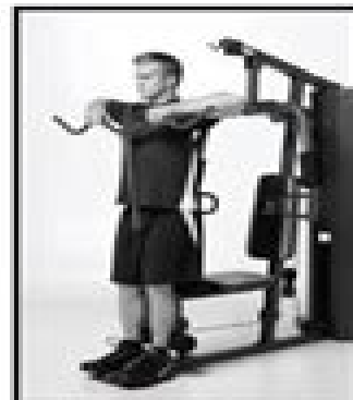
UPRIGHT ROW MUSCLE EMPHASIS: DELTOID/TRAPEZIUS