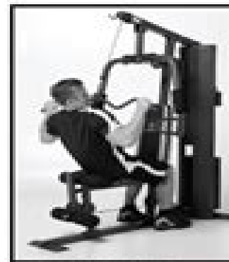
WIDE LAT PULL-DOWN MUSCLE EMPHASIS: LATISSIMUS DORSI