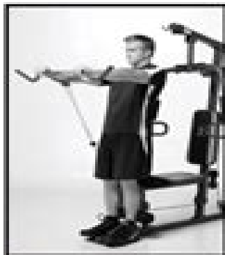
FRONT DELTOID RAISE MUSCLE EMPHASIS: FRONT DELTOIDS