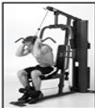
HIGH PULLEY AB CRUNCH MUSCLE EMPHASIS: ABS/COAS