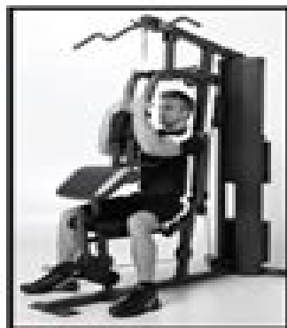
PECTORAL FLY MUSCLE EMPHASIS: PECTORALIS