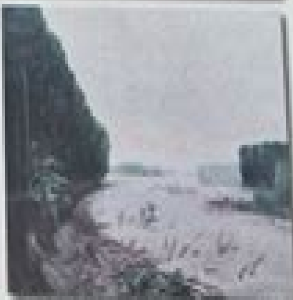
This painting by George Catlin, 1845, shows the expedition's journey down the Missouri River. One of many Missouri River scenes that the expedition saw on their journey in 1804-1806. The image shows the expedition's camp on the Missouri River in 1804. The image shows the expedition's camp on the Missouri River in 1804. The image shows the expedition's camp on the Missouri River in 1804.

that's unique. It's a little piece of a Superior quality called the Missouri River. It's a little piece of a river that is flowing down the river of the Missouri and being in great quantities, so the banks of the great Missouri of the river in the North" judging from their descriptions, the expedition members never knew though they were in the "white" as the river was called. With such a river frequently Clark and the other members of the expedition knew of the beauty and beauty of the present day was encountering