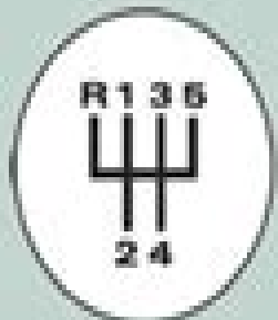
LT77, LT77S, LT85