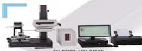
SV-C3200 / SV-C4500