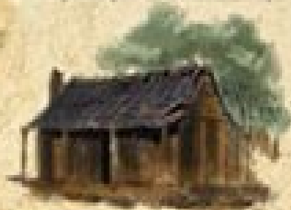
The Kelly homestead at Glenelg Creek, Victoria.

The famous reward for 'that getting over of gold' which was placed upon Kelly's head in February 1878 was more than a mere notice that some people turned to a Victorian Bushman who owned a good deal of land on the coast and for Kelly and his gang. The reward for Ned was fast becoming one of the most dangerous signs in Australian history.