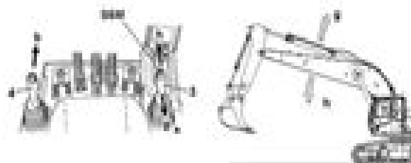
Fig. 3-76 Boom cylinders control