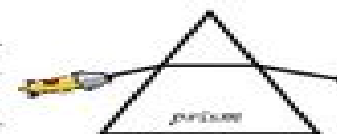
Concave laser lights refract, but don't ever spread out in a prism.

Lasers give off light of one particular wavelength. This comes from forcing a substance (usually a gas) to give off light. This light bounces back and forth between mirrors, causing other atoms to give off more light. When the light is powerful enough it escapes as a laser beam.