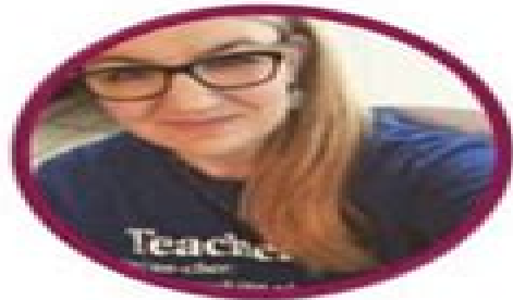
Tales Of A Fourth Grade Educator