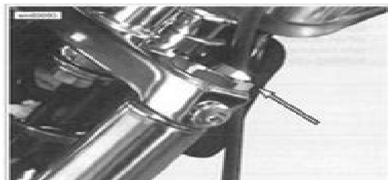
Figure 2-75. Fork Tube Cap