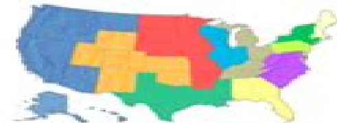
The federal system is divided into 12 districts called circuits.