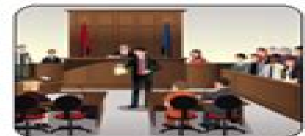
Which roles do you recognize?

The trial court is the first court to hear a case. Both the state and federal systems have trial courts. In the Federal system, the trial court is called a District Court. In the trial court, lawyers use evidence to try to prove that their client's side of the story is what really happened. Evidence can be almost anything—witnesses, videos, photographs, a letter, a piece of fabric, or even a murder weapon! In a jury trial, a group of twelve people listen to the evidence and decides who wins the case. That decision is called the verdict. In a bench trial there is no jury, so the judge gives the verdict.