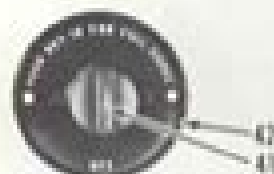
PANEL USED WITH ELECTRIC MODELS ONLY