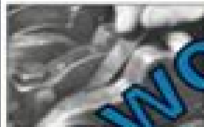
FIG. 10. STRENGTHENING OF CONCRETE BEAMS WITH FIBER REINFORCED POLYMER SHEETS

1. The Government of India has decided to launch a new scheme for the benefit of the poor and needy. The scheme is called 'Pradhan Mantri Kisan Samman Nidhi' (PM-KISAN). It is a financial assistance scheme for farmers. The scheme provides financial assistance of ₹10,000 per year to the farmers. The assistance is given in three equal installments of ₹3,333 each. The first installment is given in June, the second in September, and the third in December. The scheme is available to all farmers who are cultivating a minimum of 1 hectare of land. The scheme is a landmark initiative of the Government of India to support the farmers and improve their livelihoods.