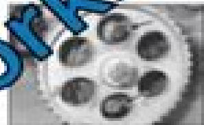
TO BE SUBMITTED WITH COVERING LETTER