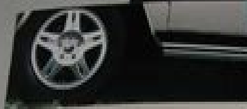
Suspension and Steering Information 2003 Edition