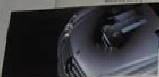
Factory Approved Service Products for