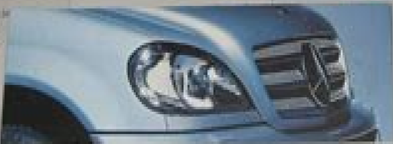
W-Class Operator's Manual