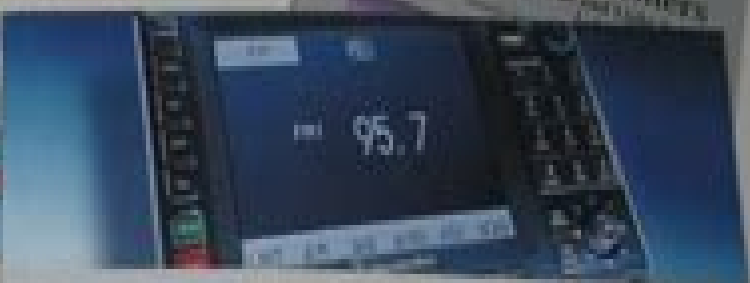
W2 Sprinter's Manual