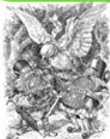
MILITARY FOR MURDER.