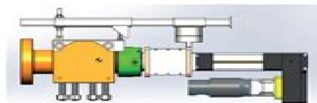
Linear Electric actuator driven (servo)

Magnum chokes offer the customer increased service life and cost savings in high pressure applications, extreme service conditions where the substantial amount of abrasives and debris are present. In extreme services/operations the magnum choke's robust design minimizes the operational downtime and equipment damages.