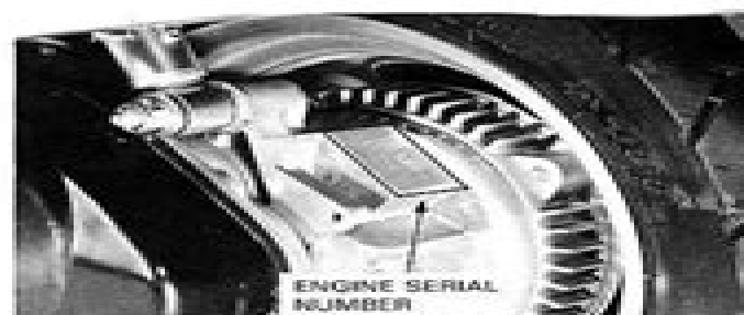
ENGINE SERIAL NUMBER

The VIN (Vehicle Identification Number) is attached to the left side of the leg shield.