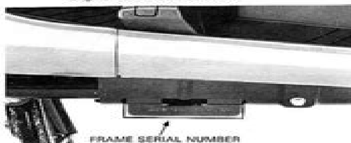
FRAME SERIAL NUMBER

BEGINNING Frame No. JH2MF020 GK000001 No. JH2MF021 GK000001 (California model) Engine No. MF02E-5000001