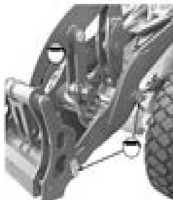
2 Front, Left Side View

NOTE: This procedure does not apply to machines equipped with PowerTilt™ pivots.