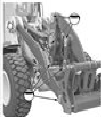
1 Front, Right Side View