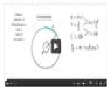
Figure 1 1 of 2

Click here to watch a video that walks through the geometry of circles, including a worked-out example. Then answer the questions that follow.