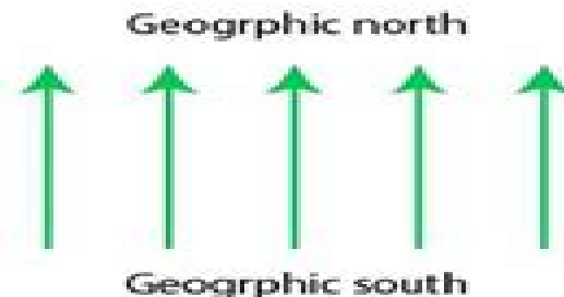
( b ) Lines of uniform magnetic field of earth

Starting from a different point, the process is repeated and another line of magnetic field is traced out. This way a few several lines of magnetic field can be traced out. Every line is required to be labelled with the help of an arrow from the south pole of the needle towards the north pole to represent the direction of the magnetic field. The figure below depicts several magnetic lines that are obtained this way.