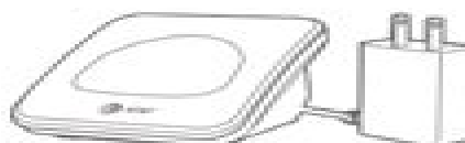
Charger for cordless handset with power adapter installed (1 for EL52219) (2 for EL52319) (3 for EL52429)