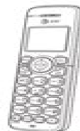
Cordless handset (1 for EL52119) (2 for EL52219) (3 for EL52319) (4 for EL52429)