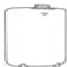
Battery compartment cover (1 for EL52119) (2 for EL52219) (3 for EL52319) (4 for EL52429)