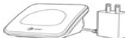
Charger for cordless handset with power adapter installed (1 for EL52219) (2 for EL52319) (3 for EL52429)