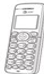
Cordless handset (1 for EL52119) (2 for EL52219) (3 for EL52319) (4 for EL52429)