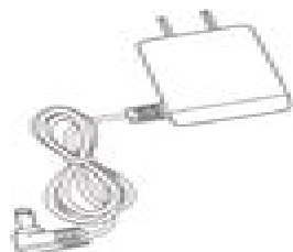
Power adapter for telephone base