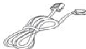
Telephone line cord