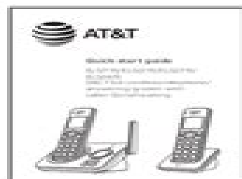
Quick start guide

Your telephone package contains the following items. Save your sales receipt and original packaging in the event warranty service is necessary.