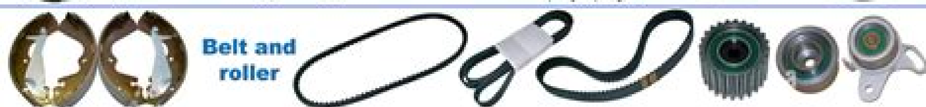
Belt and roller