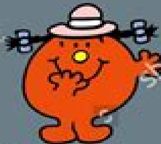
Little Miss Fickle