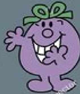
Little Miss Naughty