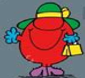
Little Miss Scatterbrain