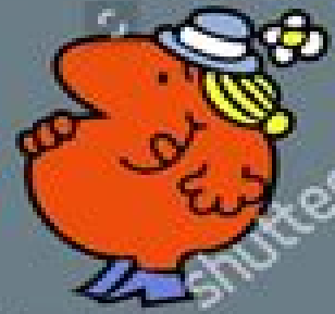
Little Miss Greedy