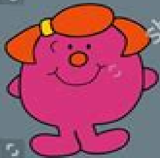
Little Miss Wise