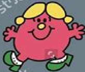
Little Miss Helpful