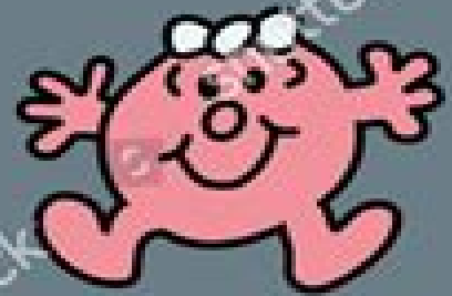
Little Miss Tiny