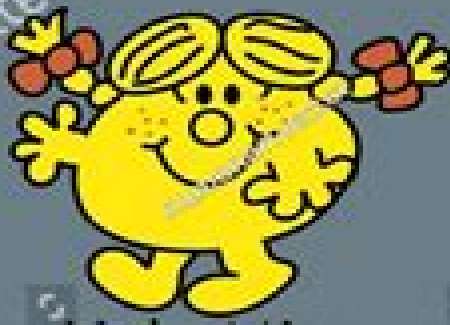
Little Miss Sunshine