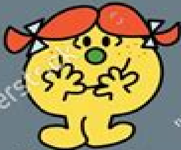
Little Miss Trouble