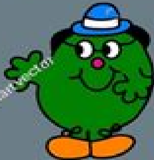
Little Miss Neat