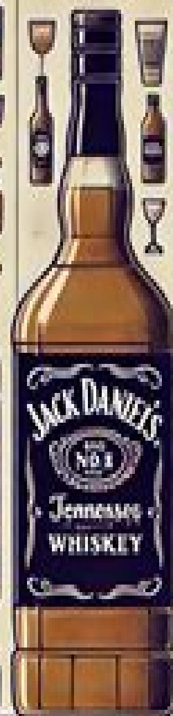
JEROBOAM Common uses