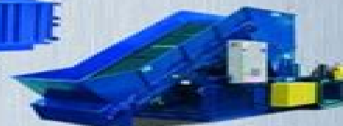
Answer Two-Ram Baler