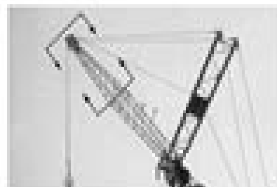
111-03 Boom Support