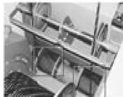
111-07 Boom Support