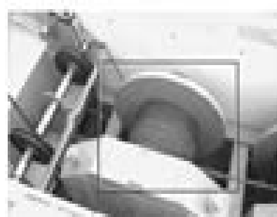
111-11 Boom Support