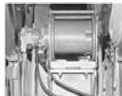
111-08 Boom Support