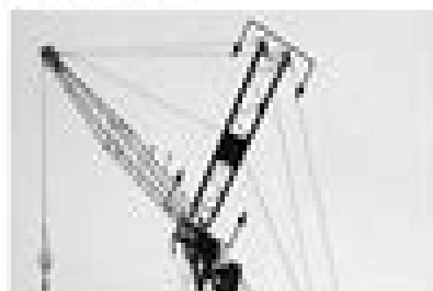
111-05 Boom Support