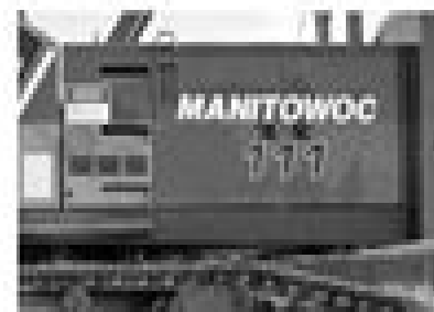
111-12 Boom Support