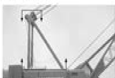
111-06 Boom Support