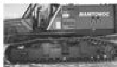
111-10 Boom Support