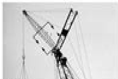
111-01 Boom Support