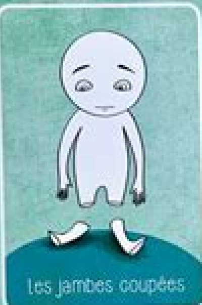
Les jambes coupées