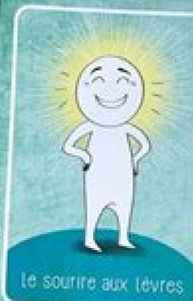
Le sourire aux lèvres