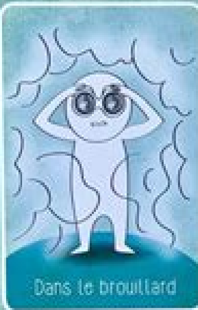
Dans le brouillard