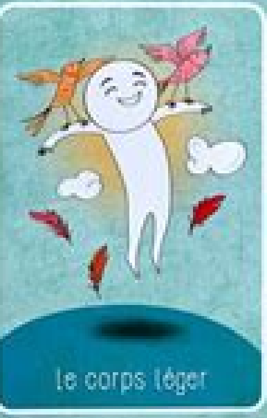
Le corps léger