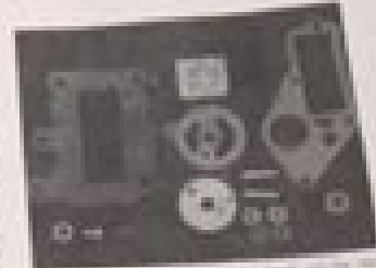
Diagram showing the installation of the carburetor onto the engine block.

Check the carburetor regularly. If the carburetor is dirty, it should be cleaned. If the carburetor is damaged, it should be replaced.