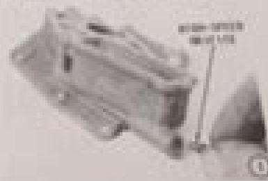
Diagram showing the removal of the high-speed jet from the carburetor.

1. Remove the high-speed jet from the carburetor using the proper size hex key. To prevent bending the edges of the jet, use the proper size hex key.