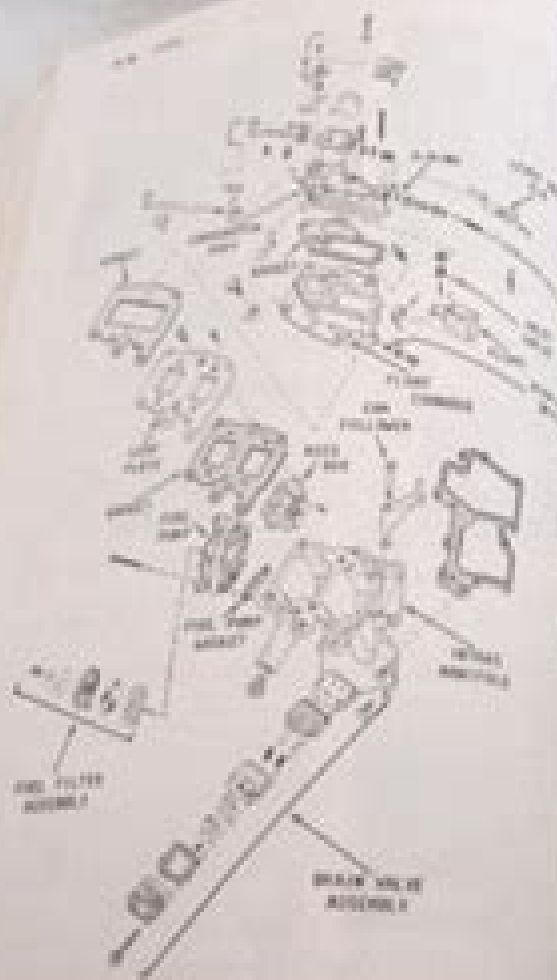
Exploded view of a Type 22 carburetor installed on a 4-cylinder engine.