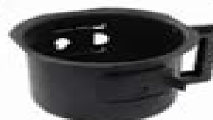
AZ002068 Ash Holder