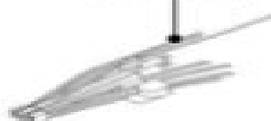
* Escutcheon (B07-xxxx-xx)