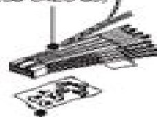
* Screw set (N99-1757-15)