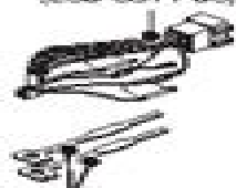
Lever (D10-7012-04) x2