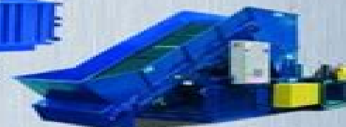
Answer Two-Ram Baler